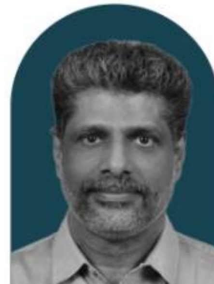
PV Harif Coimbatore